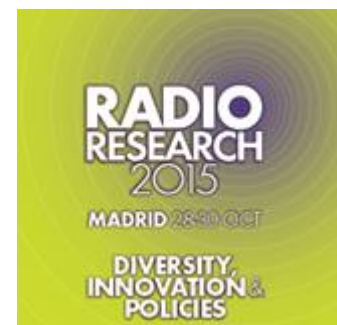
Figure 2: Conference logo

The conference was disseminated through this website: http://radioresearch2015.org/radioresearch/ . The proceedings books will be published in the first semester of 2016.