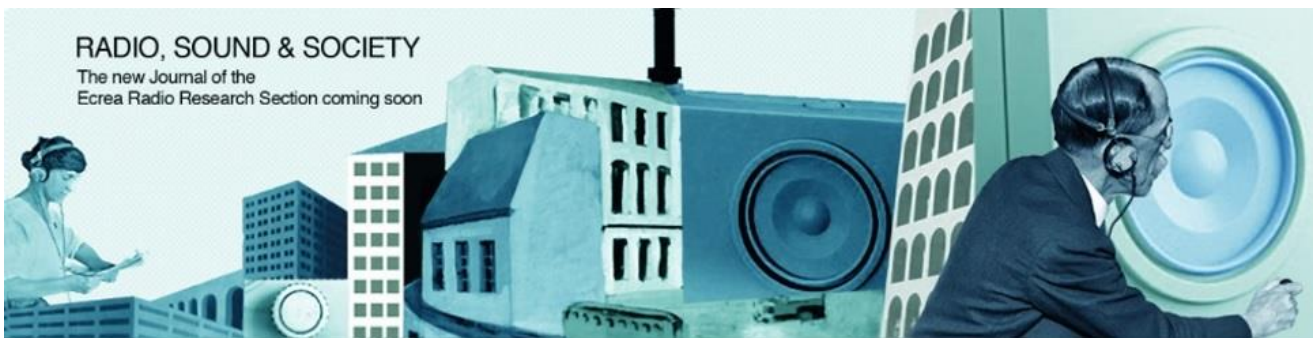
Figure 4: Radio, Sound & Society journal's header

The Radio, Sound & Society has already a header (Figure 4) and its online platform has been prepared to be accessible at http://www.ecrea-radioresearch.eu/journal-rss .