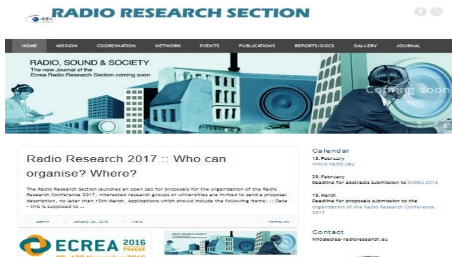
Figure 1: Print screen of the new website's homepage

After several contacts with some members of the Ecrea Executive Board and the former chair, the team realized that there was no access to the back office of the section's website ( http://sections.ecrea.eu/RR ). Following the recommendation of the Executive Board, the coordination team developed a new website, recovering some information of the previous one and updating news and some data. In tune with the new journal's design (see page 3), the identity of the section turned from green into blue, as shown in Figure 1. The new website can be accessed at ( http://ecrea-radioresearch.eu ). The domain and hosting costs were funded by the financial results of the Radio Research 2015 Conference.