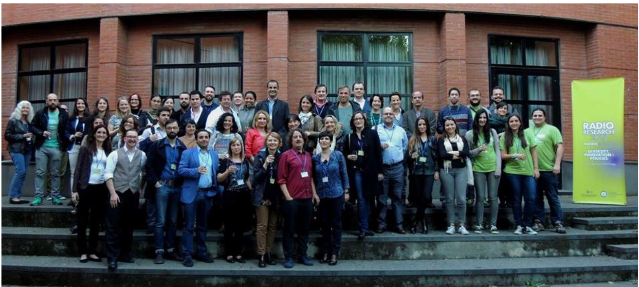
Figure 3: Picture of the group at the end of the closing session